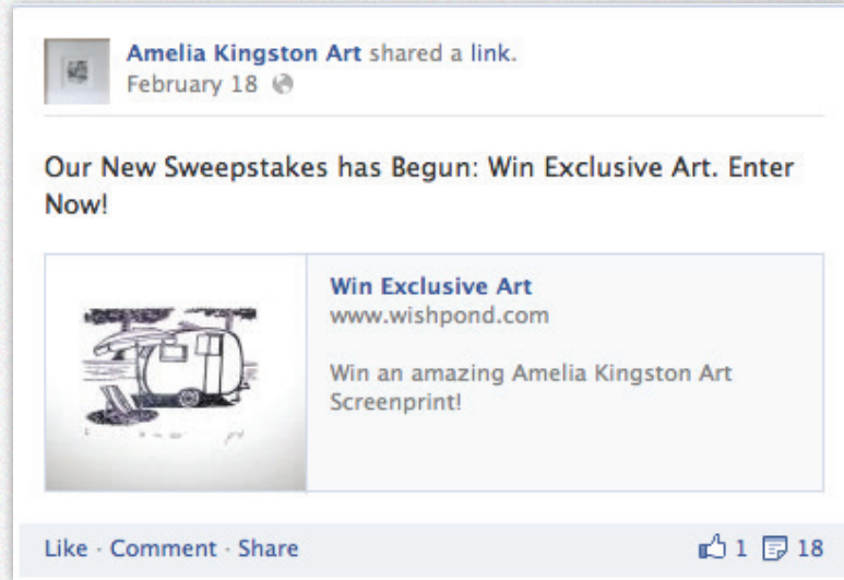
Wishpond Sweepstake Contest Sharing Post